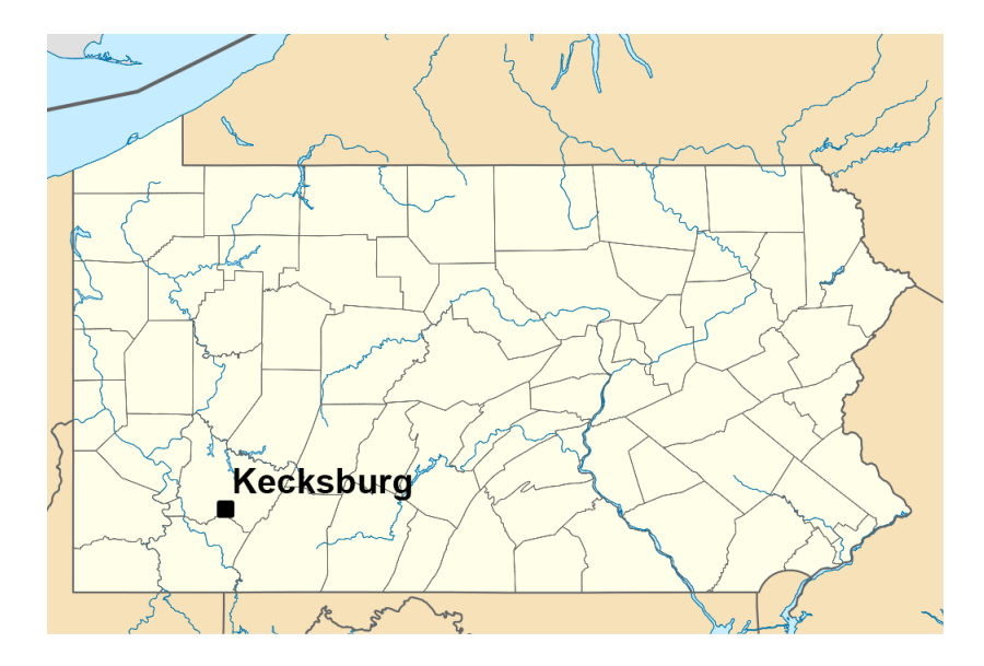
Kecksburg PA, where the acorn-shaped object fell.

We were soon both taken to the Cape Kennedy aircraft skid strip, in other words, the airport runway. We boarded a small jet plane. It was a NASA twin-engine Lear Jet aircraft that could carry 6 people. It had a two person crew, the pilot and co-pilot. We took off at great speed. We arrived shortly