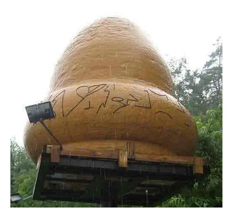
"It is like unintelligible child-like scribble, sir." He agreed.

all of a sudden an armed guard said stop. The NSA person said it is okay. The Army guard stepped back and saluted the two DoD officers after this intervention from the NSA officer. I began to photograph the craft. My NASA associate and I took many notes and photographs. It was approximately 12 feet long and about 6-7 feet wide in diameter. At the base of it, below the acorn nosecone, it had a raised shape with markings, strange childlike scribble on it. I had my sharp pocket knife and tried to scrape a sample of the craft in an attempt to obtain a small sliver of the metal for later laboratory analysis at the NASA Value Analysis