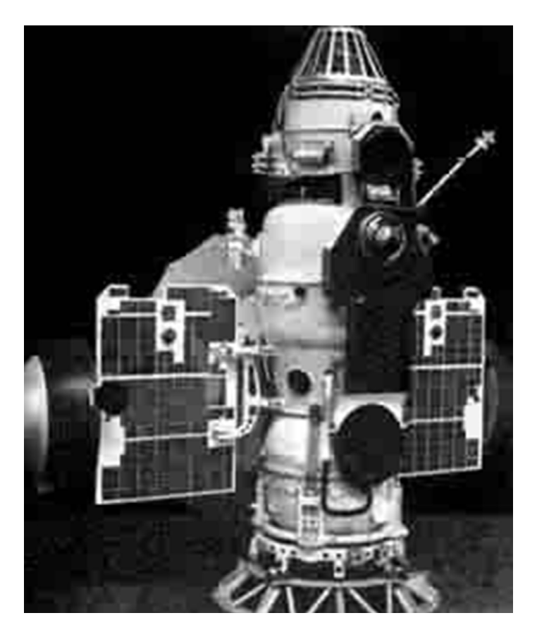
U.S.S.R. Venera 3 MV 4 (probe) Venus cone-shaped capsule

Foreword: Please keep in mind that as you read this account of what happened at Kecksburg in 1965 that I have recounted it as accurately as possible from memory and I have drawn some of the information presented here from my notes that I kept. I vow that I was there when it happened and the parts of my information in regard to the investigation I made are accurate. I was assigned to investigate what came down there along with another NASA High Tech Director. We were in charge of making a technical report, and photographic assessments of what happened on December 9, 1965 in Kecksburg, PA. A UFO was reported to have crashed in the woods there by the local witnesses who saw it land. An investigator from Greensburg showed up named